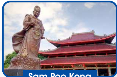
Sam Poo Kong